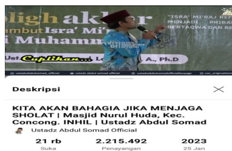
Figure 2. lecture "we will be happy if we keep praying".

In the discussion on the YouTube channel "We Will Be Happy If We Maintain Prayer" with a duration of 57 minutes 49 seconds and 2.1 million viewers and 20 thousand likes. In the video, Ustadz Abdul Somad explains that what is taken with death is only prayer, and the first thing to be accounted for, the first thing to be counted, the first thing to be asked, the first thing to be responsible for is prayer.