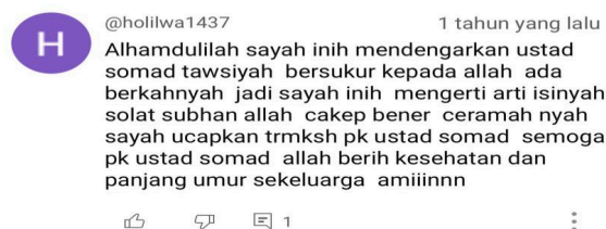
Figure 3. UAS lecture comments

In addition, Ustadz Abdul Somad also said that true happiness can be achieved by maintaining prayer, because prayer is a form of direct communication between servants and Allah, then Ustadz Abdul Somad also